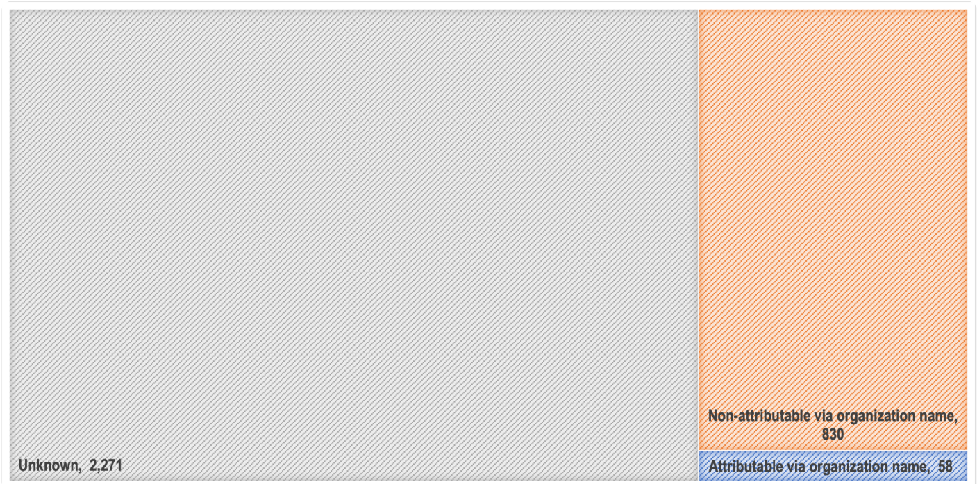
Chart 2: Percentage of the total number of domains containing Crédit Agricole owned but were not owned by the bank

identified registrant organization. The rest didn't share that particular WHOIS record detail or left the field blank.